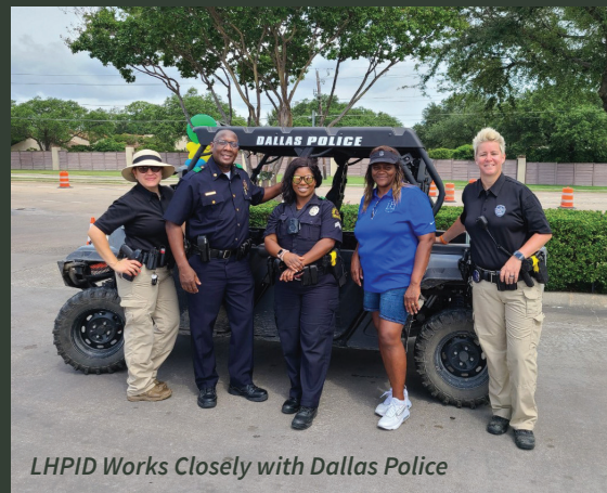
LHPID Works Closely with Dallas Police