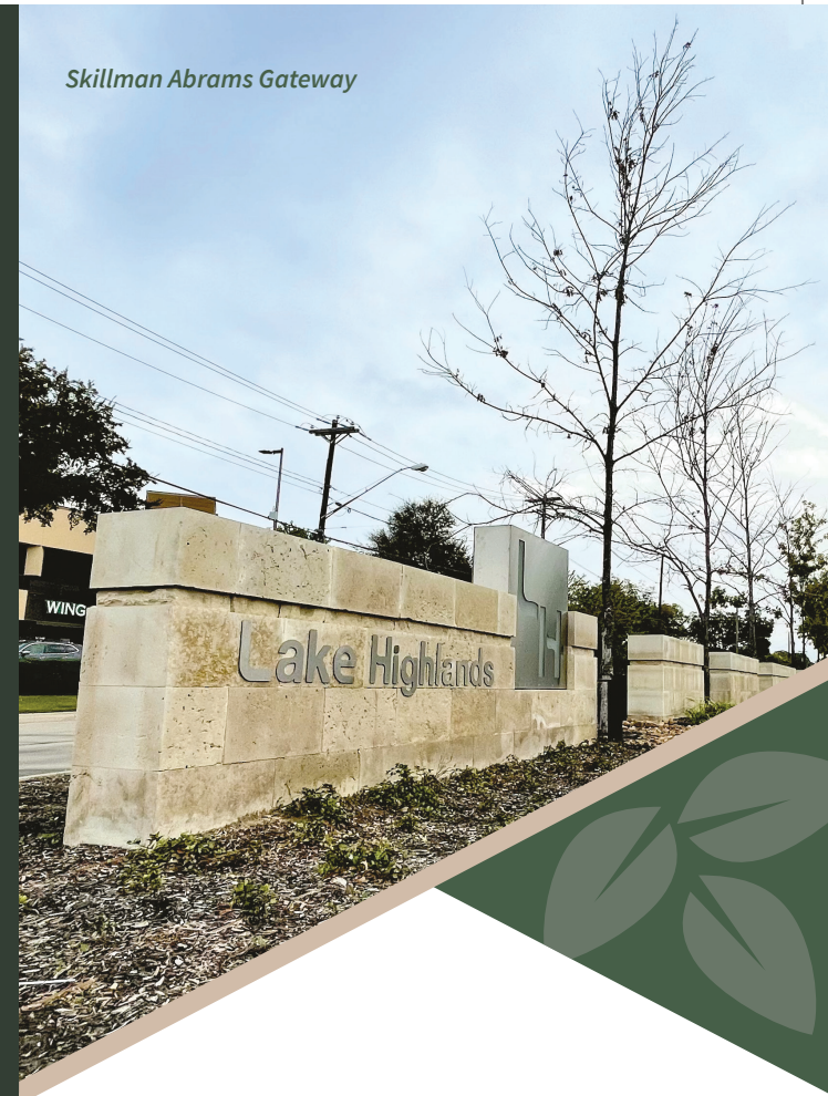
Skillman Abrams Gateway