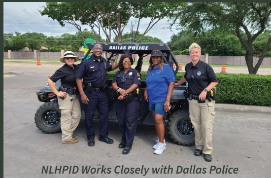
NLHPID Works Closely with Dallas Police